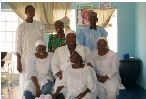
Project staff in the Jahun WWCC in Jigawa State.

In 2004, FORWARD started a four-year initiative to improve maternal and child health services and raise awareness about HIV/AIDS and other STIs in Kano and Jigawa states, funded by Big Lottery Fund (UK).