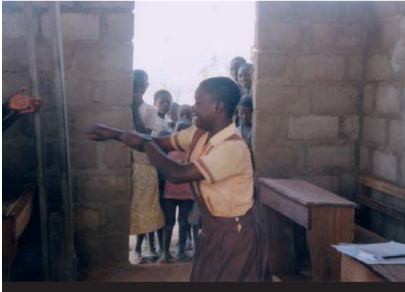
A student in Ghana welcomes the FORWARD Chairperson.

ber. A daughter is chosen to produce children with a cousin to maintain the family name and inherit property. The practice raises important questions concerning care and maintenance of the resultant children by single mothers, forced sexual relations and women's inheritance.