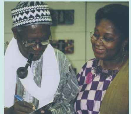
Founding Father of African Film Ousmane Sembene makes Adwoa's day signing her copy of Moolaadé.

FORWARD believes that Moolaadé is a great advocacy tool which can be used to draw international attention to FGM as a sexual and reproductive health and human rights issue and to promote positive change for women in modern day Africa. FORWARD has already started seeking funding to use Moolaadé with NGOs in Africa.