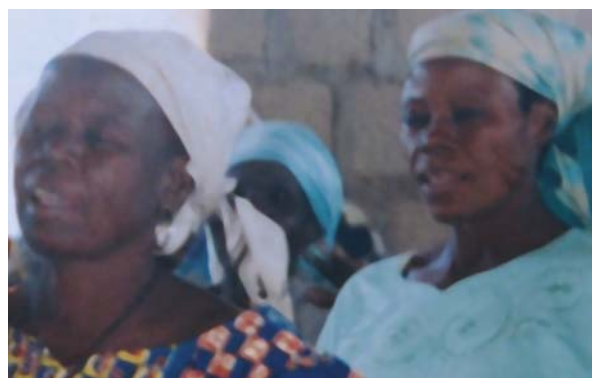
Members of a Widows Group at a meeting.

The survey revealed some disconcerting facts about female participation in education. Overall access to education and literacy rates were low for both men and women (42% and 28% respectively) but in one of participant communities 94% of adult women had never had any form of education. Participants attributed the low level of female participation in education to pregnancies/marriage, migration, lack of role models, poverty, modernity and traditional practices.