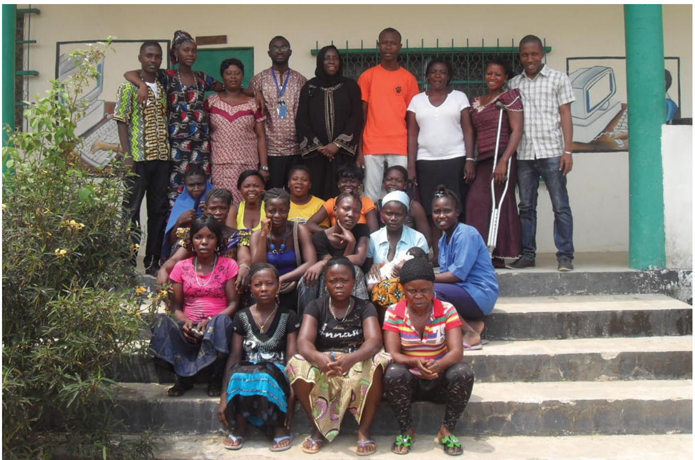
Haikal Staff, PEER researchers and supervisors

Scholarship schemes would enable young women to stay in school. This would reduce their dependence on men to support them, either through child marriage or 'man business', and indirectly make them less likely to develop fistula. Micro-loans could help women with fistula to kick-start businesses, and help them cover living costs if they want to return to school. This would be a critical enabler for women to reintegrate into their communities.