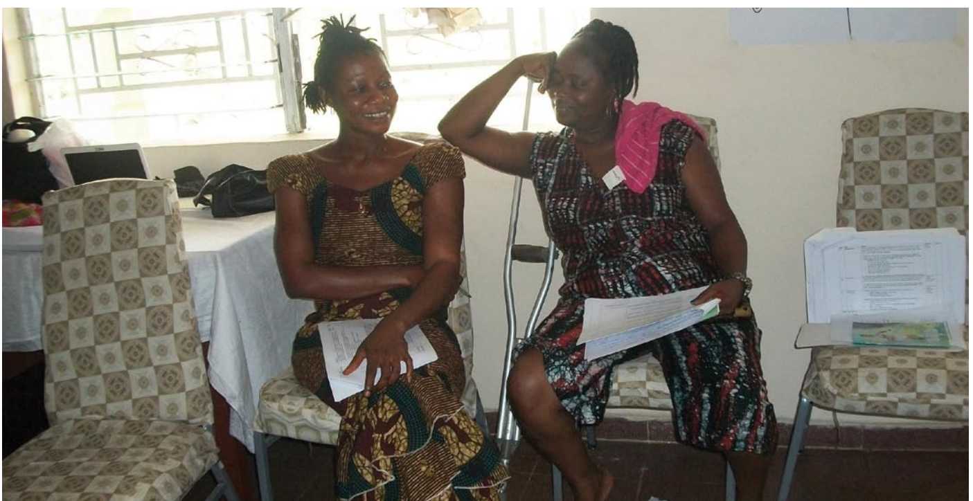
PEER supervisors share a moment

"Most families cannot afford to send their children to school and this can be the most difficult but one day things may change. I hope to go to school and continue my education."