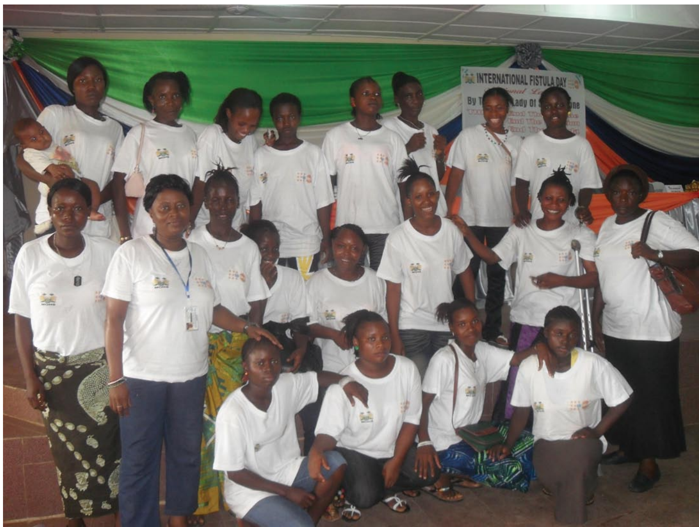
PEER study participants celebrate the first International Day to End Obstetric Fistula