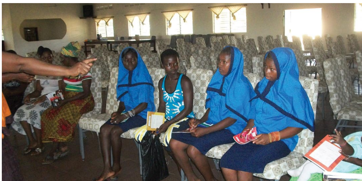
PEER researchers take part in a training session

During the workshop, the facilitators and PRs worked together to develop prompts to guide in-depth conversational interviews on key themes including daily life in Bo, sex and early marriage, pregnancy and childbirth, experience of fistula, access to information, and services and recommendations from the girls (see Annex 1). PRs had ample opportunities to practice the interview techniques using the prompts they developed. The PRs were equipped to comply with the ethical standards of conduct during the course of the study. They were informed of the importance of confidentiality in data collection and instructed to seek consent from interviewees. All participants could direct interviewees to the appropriate support services when required.