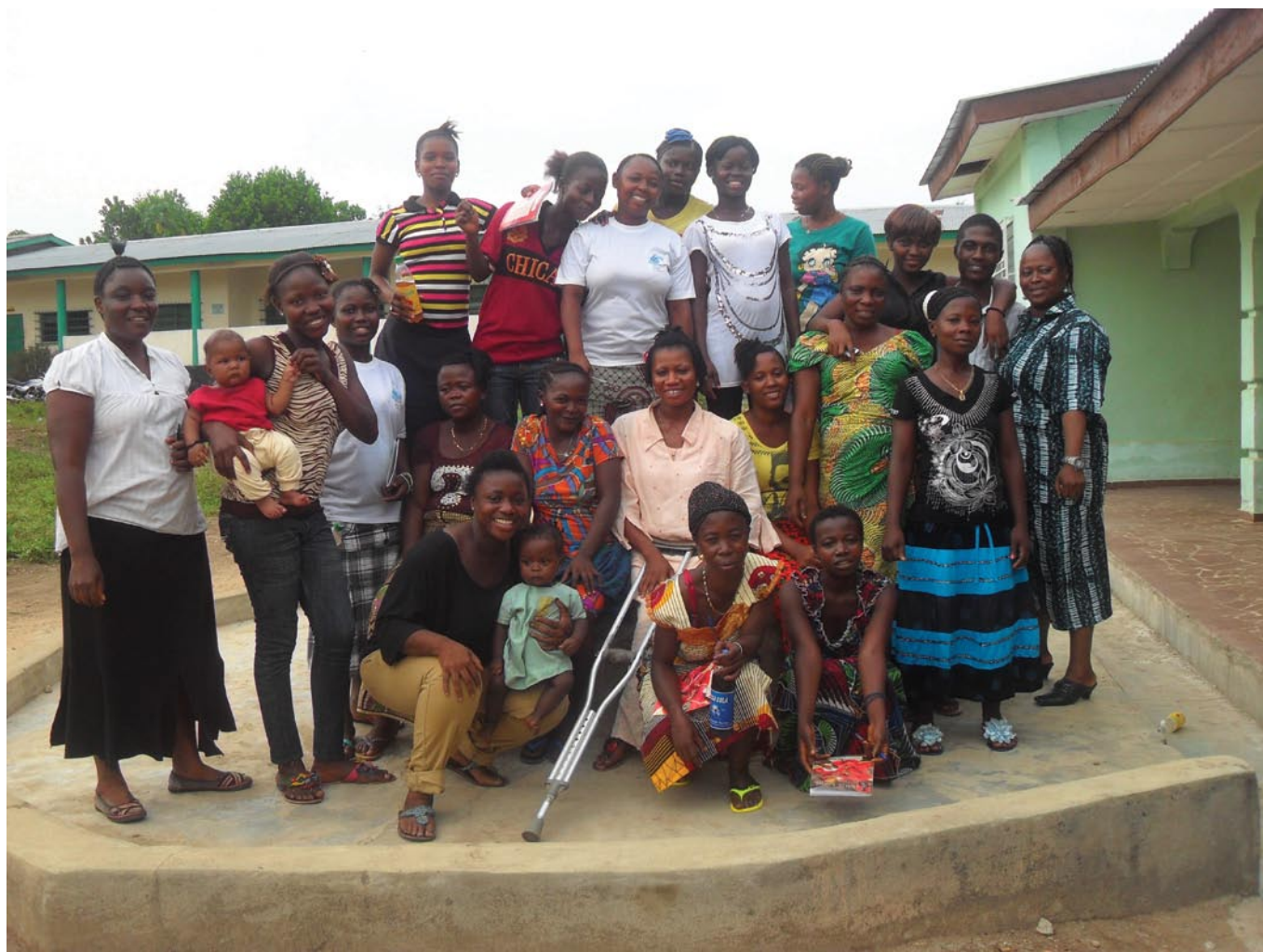
Participants of the PEER study on the last day of the research