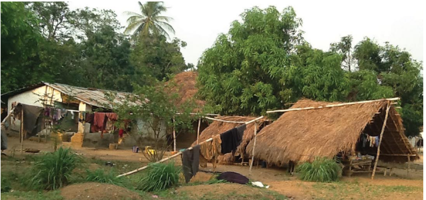
Typical homes in Bo, Sierra Leone

"We normally spend the whole morning in the bush trying to collect good firewood for hours before we can find any and then with the help of the smaller children we carry buckets of water to our village and sometimes we make more than five trips."