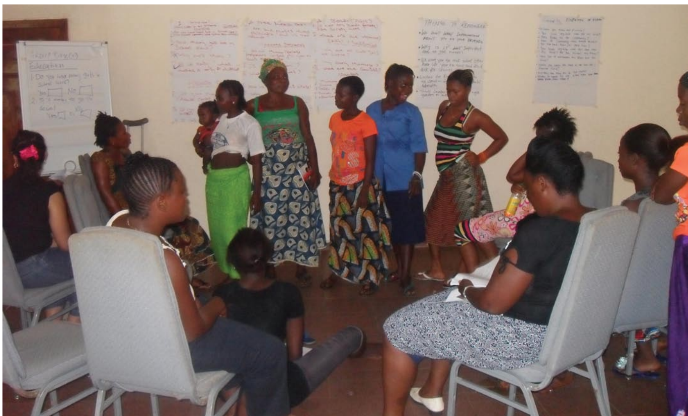
PEER participants develop questions for interviews during a workshop

age and they sleep with men who don't use condoms as well."